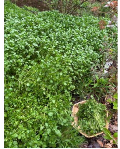
Watercress in a shady spring