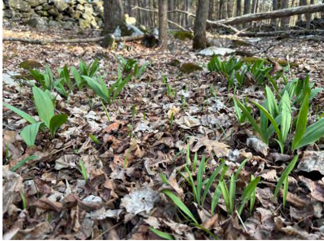
Ramps ramping up!