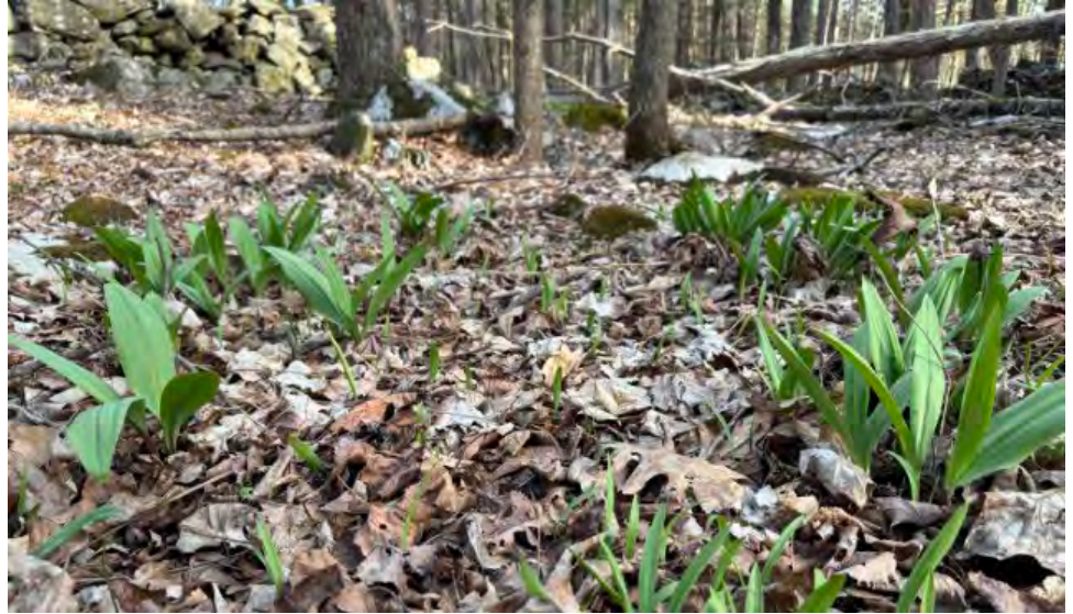
Ramps ramping up. See recipe for ramps and morels at the end