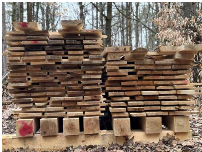
Oak boards cut on the portable sawmill, we can finally access now that the snow is gone.