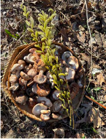
log grown shiitake with pussywillow

Photos by Katie Campbell-Nelson, March – April 2025 and 2026