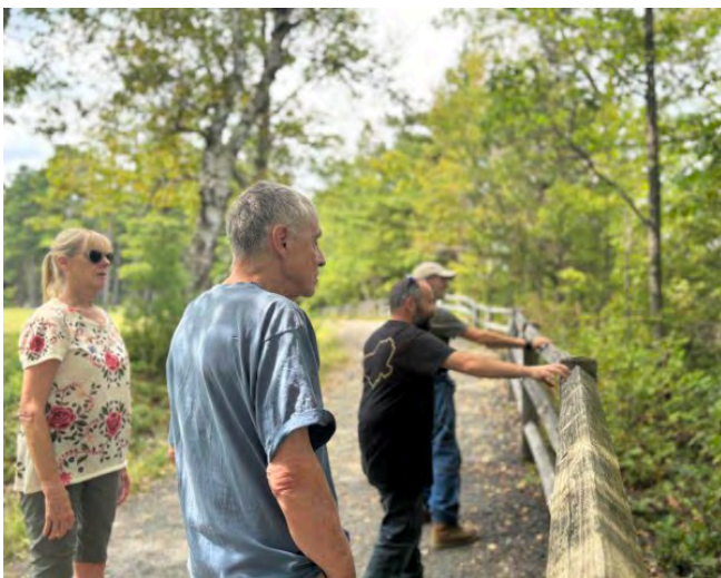
Going to a walk during the annual NYFOA – CDC picnic, 2025

RSVP to: happyinthehollow@gmail.com . Please let us know if you need any accommodations to participate. We have transportation options for folks with limited mobility.