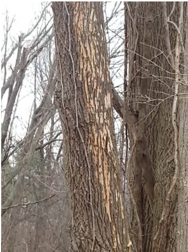
Blond bark is the most prominent sign of borer infestation caused by woodpecker damage.

The emerald ash borer is the primary cause of death for native ash species (genus Fraxinus ) in Columbia County, based on observations I have made over the past decade of travels largely associated with birding, and a survey conducted as a volunteer with a DEC representative. Mountain ash (genus Sorbus ) is not killed by the borer. Borer larvae kill ashes in two to four years by feeding on the inner bark and phloem, girdling the infested tree. Check annually for signs of borers to make timely ash