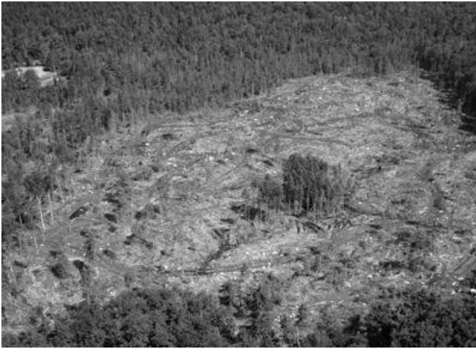
Aerial view of a biomass harvest in the Adirondacks

A recent analysis of forest resources in Connecticut, Maine, Massachusetts, New Hampshire, New York, Pennsylvania, Rhode Island, and Vermont showed that wood could replace up to 25% of the oil and gas currently being used for commercial and industrial heating in the northeast. "The heat generated by locally-grown biomass can reduce dependence on fossil fuels and support local economies," said Dr. Charles D. Canham, a forest ecologist at the Cary Institute in Millbrook, New York and co-author of the report. "But each forested landscape is different, and regional variation in forest conditions and energy infrastructure means there is no one-size-fits-all solution."