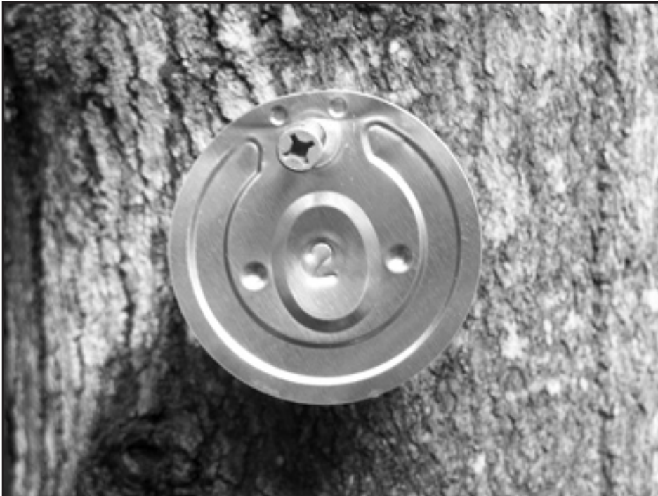
A homemade tree tag.

On a cool spring day in 2007 I opened a can of soup for lunch. As I rinsed off the lid it struck me, “Tree tag!” I had been struggling with how to “mark” a tree so I could monitor its growth