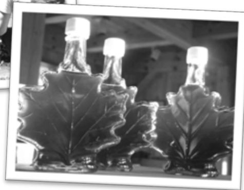
Maple Syrup Production for Beginners September 20, 5:30 - 7:30 p.m. CCE of Broome County 840 Upper Front St. Binghamton, NY

We'll be returning again September 10th to the deer exclosure to check its progress and see any results. Is your forest being managed mostly by deer? Come see for yourself. (CFA & NYFOA members free) $15 non-members. Sturdy shoes are required. Pre-registration required. For directions and more information call CFA at (845) 586-3054 or e-mail: cfa@catskill.net