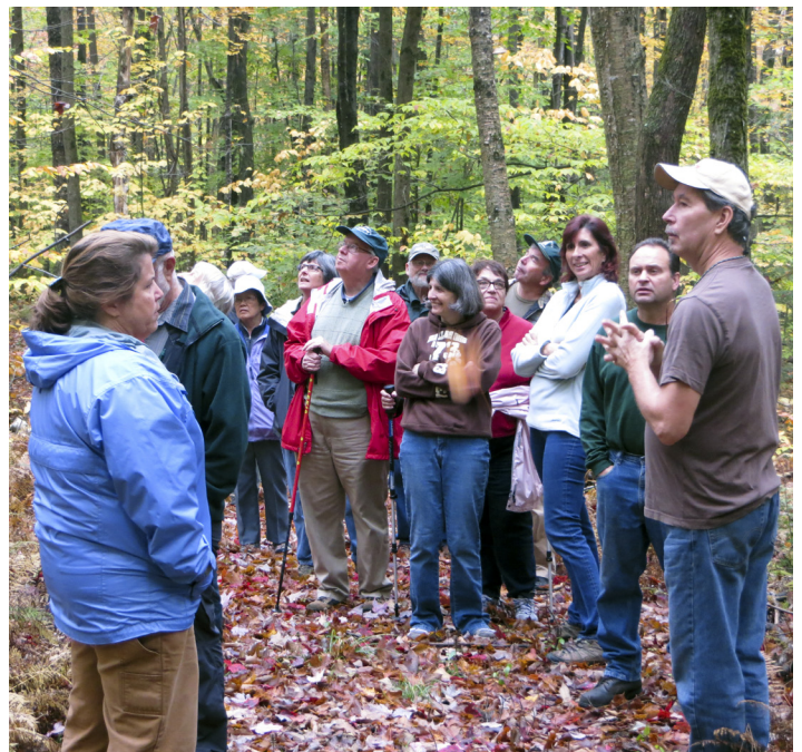
Eastern White Pine blowdown.