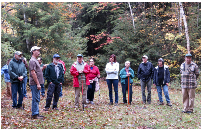
Treated area of Japanese Knotweed.