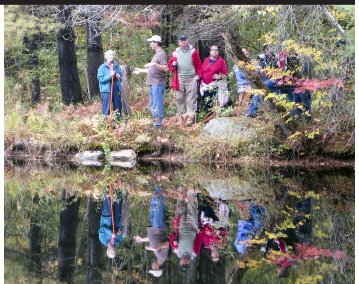
Pond area with Autumn Olive and Wild Grape.

Our woods walk concluded just in time as the rain became steadier. We dodged the raindrops to cook some picnic fare on the grill. The day concluded with the raffle where all went away happy thanks to the generosity of guests and other contributors. We are looking forward to hosting again soon.