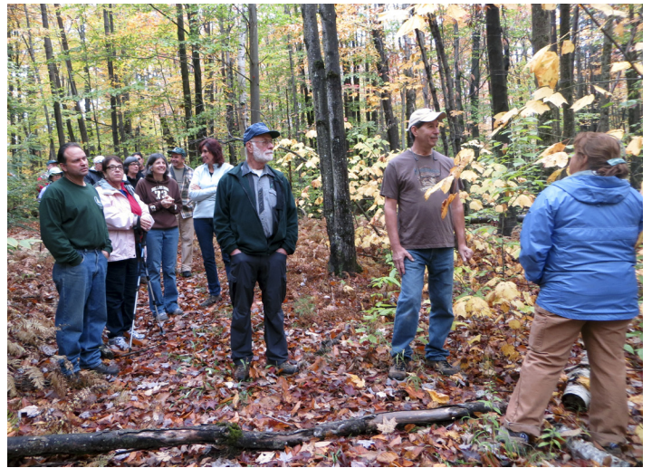
Stand 1: Ash, maple and birch.