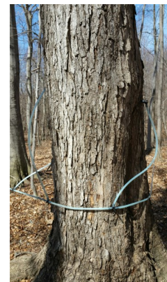
3 tap maple.