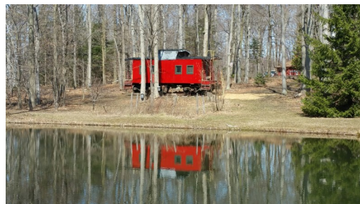
Doesn't everyone have a caboose in their forest?