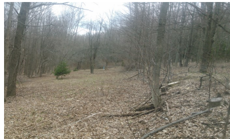
Invasive species cleared out

was promoting the growth of the pre-existing orchard by trimming and planting more apple trees as well as other hardwood and conifer species to diversify the woodlot. The 11.7-acre parcel is 50% wooded and the remainder being field and orchard. The field at this point is a great bedding ground for the deer population.