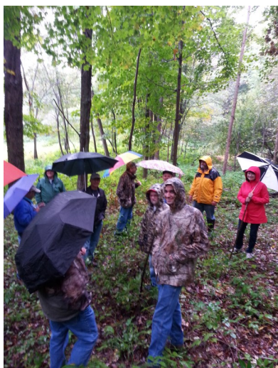
Rain or shine, doesn't keep us from a good woodswalk!!