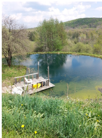
Over 100 acres, plus this....