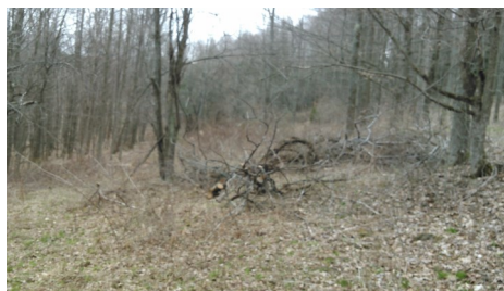
Invasive species before clearing

In 2013, Jeremy had a local NYS DEC Forester, Gregory Muller, come to the property to help create a forest stewardship TSI plan. Greg diagnosed the woodlot as abandoned pasture land and marked a series of trees for removal. Jeremy was impressed by the forester's willingness to help, ideas provided and woodlot diagnosis. The major concerns for the property were creating a trail system to navigate the woodlot and thinning the forest, starting with the abundance of hop hornbeam and ash. Second was the removal of invasive species such as multi-flora rose, barberry and honey suckle. The multi-flora rose has been a nightmare for Jeremy, between scratches, cuts and the overall property infestation. Last