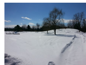
So silent in the winter....