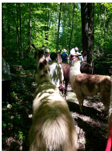
Even the llamas enjoyed the woodswalk!