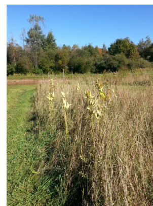
Fall food plot.

Don Kuhn 583-1997 deekuhnzie@verizon.net