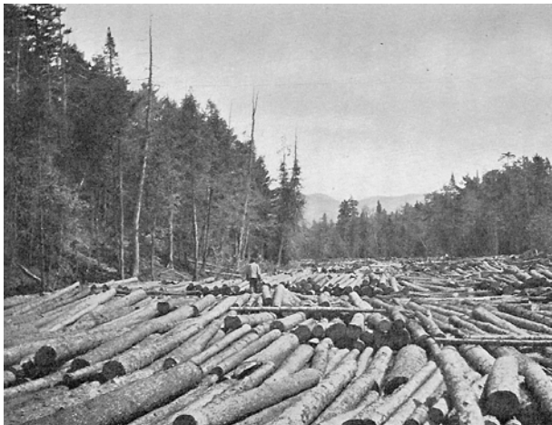
A log "landing" on Ampersand Creek just before the spring log drive to Tupper Lake about 1900.

The solution was to use streams and rivers to float logs to the mills. This method was so successful that log drives in the Adirondacks continued until the 1950's. Timber was cut during the winter months, and the logs were piled along stream banks where they could be pushed in after ice out. Splash dams were constructed in smaller streams to provide the extra surge of water needed to float the winter's harvest over rocks and other obstacles. However, the spring log drive was still difficult and dangerous work.