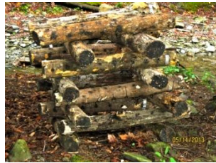
A suggested method for stacking your mushroom logs.