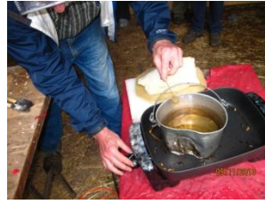
Dr. Mudge showing the hot wax to seal holes.