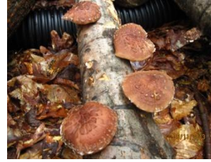
Shiitake mushrooms fruiting.