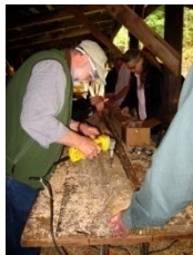
Participants drilling holes.