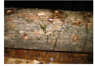
Waxing holes filled with sawdust spawn.