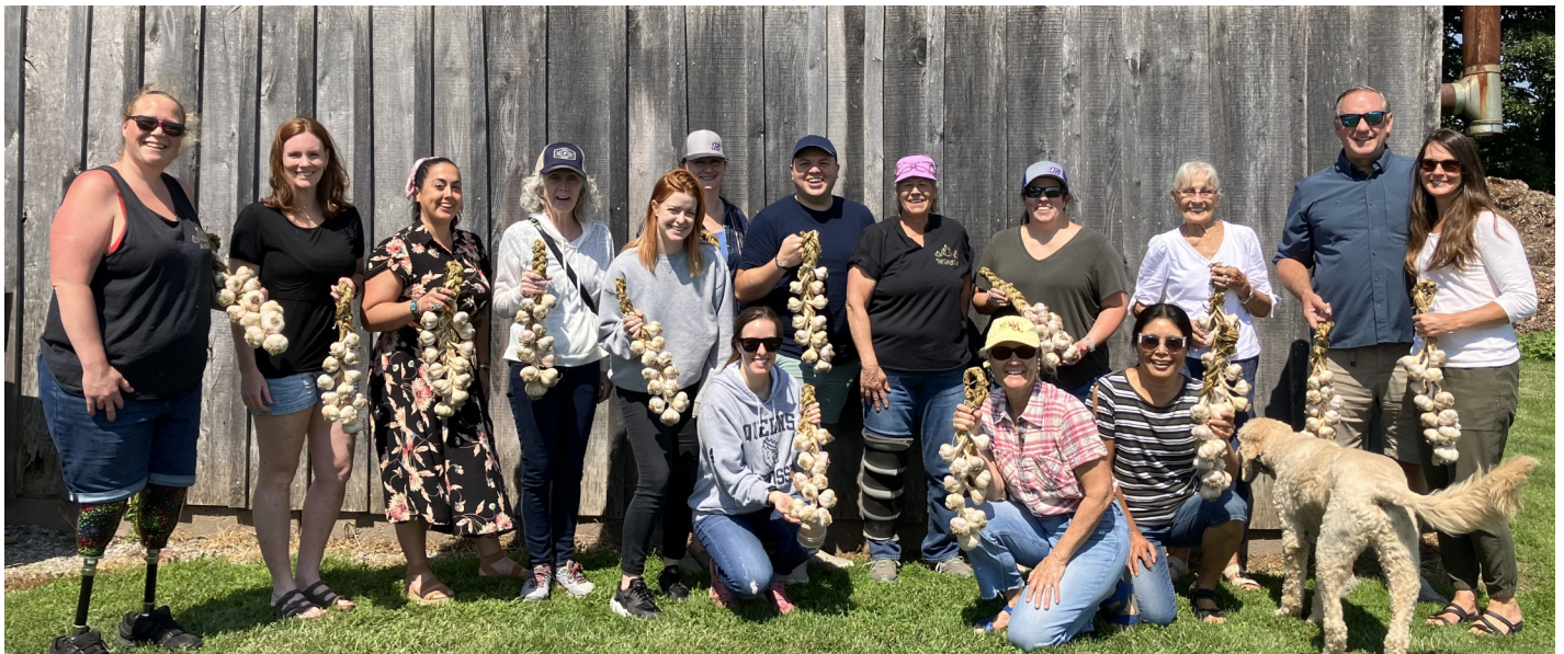
Garlic braiding champions!

August of 2024 is set for the 4 th Annual Garlic Braiding extravaganza. Hope to see you there!