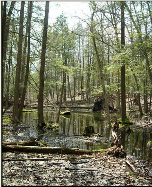
A flooded vernal pool in the springtime

are unique wetlands that provide critical breeding habitat for several amphibian species of conservation concern in New York. Learn to recognize these often inconspicuous pools, understand their habitat values, and discover what you can do to conserve these special wetlands.