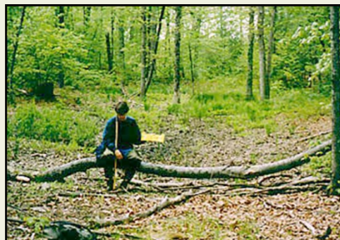
A dry vernal pool in the summer

Some sunnier vernal pools may contain sphagnum moss, sedges, ferns and shrubs such as high-bush blueberry or buttonbush. Red maple and eastern hemlock commonly grow on the edges of vernal pools, although pools may be found in many different forest types. Dry vernal pools can sometimes be identified by the presence of dark, matted leaves within a depression in the ground.