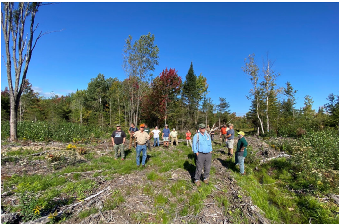
One of the many large regen cuts we reviewed

Last Fall some NAC members attended the 1 st Annual walk at same property and it was a very positive experience. We viewed and discussed various appropriately sized regen cuts to create ideal habitat for Grouse, Woodcocks and other birds. One of the many take away messages for me was how the whole effort is not just about bird hunting but about habitat. As some of the actual bird hunters present noted, “we hope to see a lot of birds and maybe we take a shot, but most of the time we do not, but its still a good day!”.