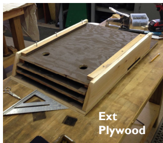
\frac{3}{4} "-1" baffle spacing, side slot and pass thru hole (hallway)