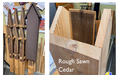
'Rocket Box' style allows Bats 360° movement to find best temperature