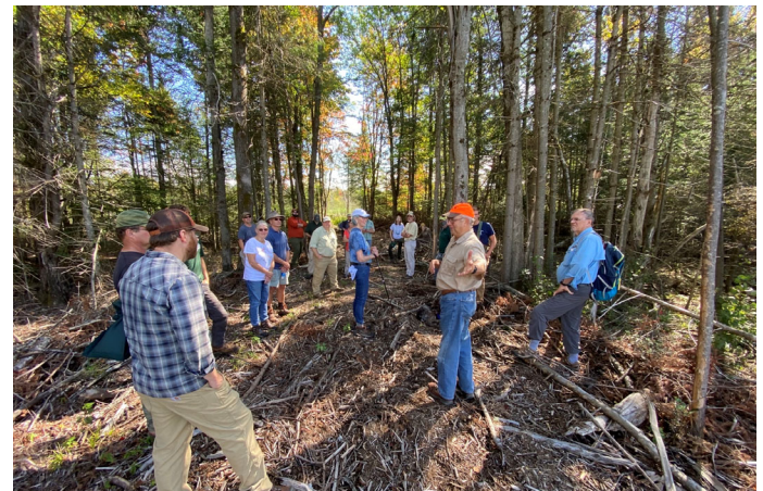
Various sized wooded sections intermixed with the cuts