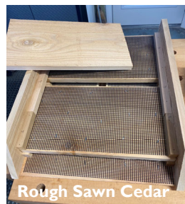
Mat netting or scratch surface for traction