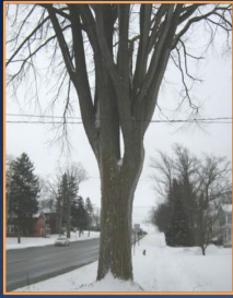
Loss of elegant American Elm on Nelson Street to Dutch Elm Disease