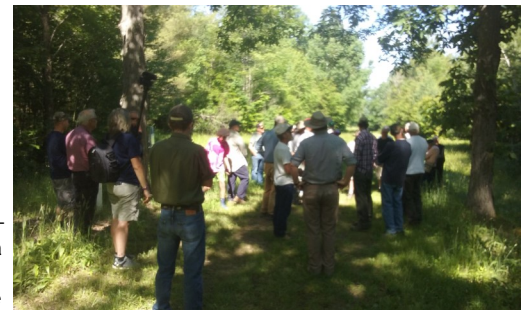
Discussing one of the marked trees.

After a fabulous lunch and much socializing back at the garage we loaded up the wagon and headed to a woodlot severely highgraded before the Piestraks purchased it.