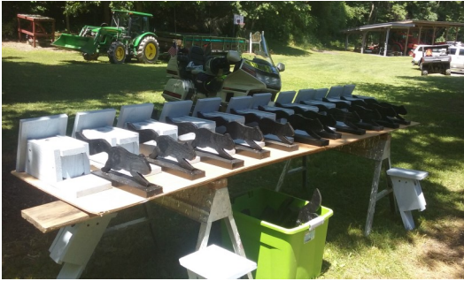
The selection of gifts for all attendees.

Two words. The good old fashion Woods Walk. They are for everyone