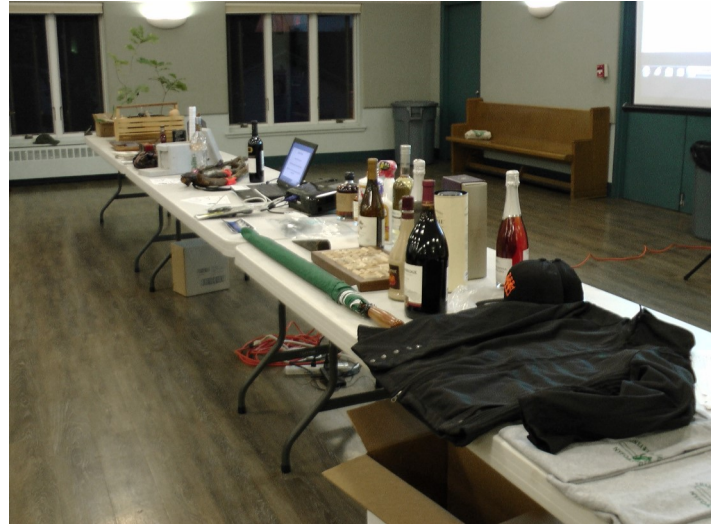
Some of our 2017 Door Prizes on display.

We encourage all WFL members to attend and we graciously welcome all members' friends, family, and neighbors to enjoy an evening of delicious food, opportunities to make new contacts, and to take home some great door prizes and raffle items. A great time is always had by all.