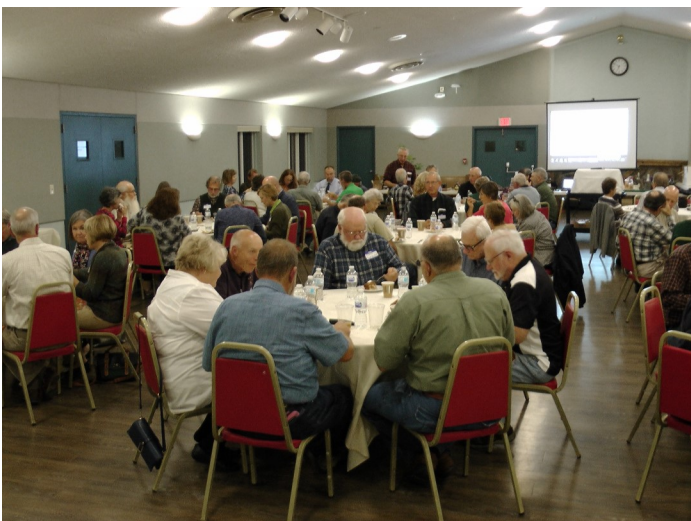
Our 2017 Annual Meeting, In Progress