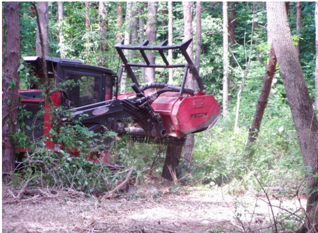
Cutting the stump down to size.

tunity to reforest the stands with desirable hardwoods. The pragmatic use of herbicides establishes the desirable species sought as part of the overall management program. A Fecon Mulcher is used by Corey's firm to mow the invasive species and disturb the soil to reduce re-sprouts. The cover photo shows the business end of the machine and in the foreground is the residual surface. The mower deck can be raised to cut an undesirable tree about ten feet up and the remaining stump penciled down to the soil.