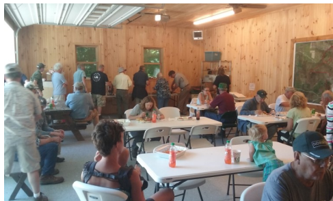
Grabbing lunch in the garage.

No matter the size of the parcel you own, the mechanics, the philosophies, the dreams are shared. So if you want to tap 10 sugar maples this coming season, attend that woods walk at the sugarbush who tap 10,000 trees are tapped and scale the plan to fit your goal/ budget. As