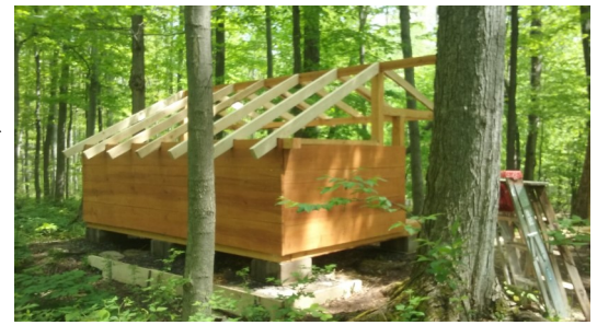
Rafters going up on day four

Until then, this weekend it's cheeseburgers on the hill out back.