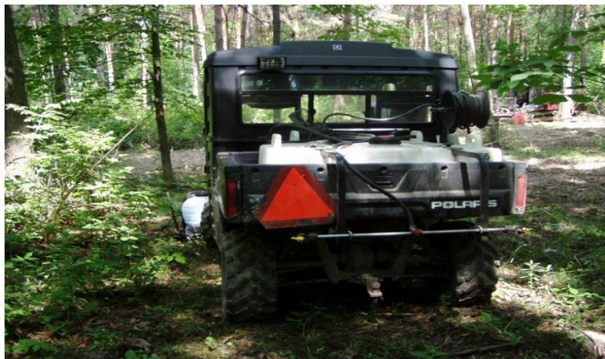
The Polaris with its 65 Gallon Tank.

Follow up spraying with a nonselective herbicide such as Roundup or a Roundup mix, will eliminate any sprouts and will breakdown quickly allowing for hardwood regeneration. The spray rig, a Polaris, has a 65 gallon tank capable of both boom and gun application. Backpack spraying can also be used.