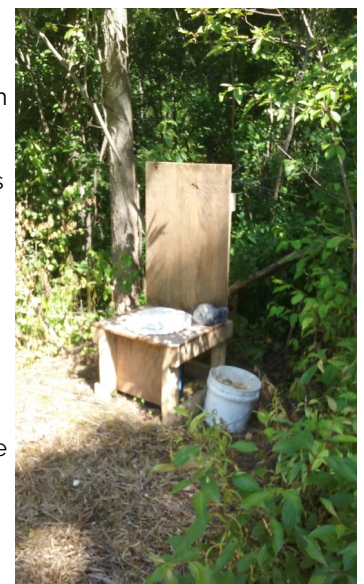
The Ladies room

(Please see the outside cover for the end result of this project)