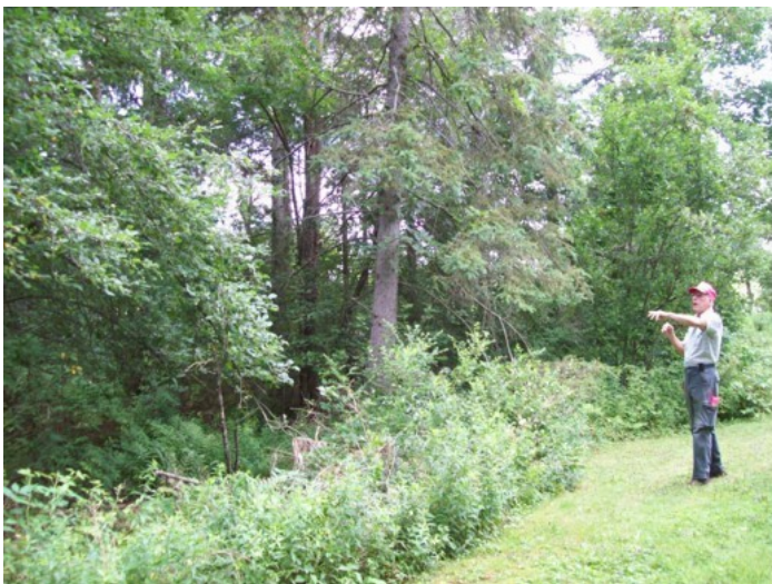
Landowner Dale Schaefer points out an area of concern.

be the information/statistics you record and track for your apple trees to accurately assess your apple tree health. It may be a surprise, but fertilization is the last step in revitalizing a tree. We learned how to take trees that may be struggling in one way or another and evaluate what is happening to that tree to make it a young tree again. Being aware of the difference in how a tree can trap energy and how it can store energy so there is a good balance is key; understanding energy to the point that we will make the tree young again. Bruce has experimented over the past ten years with some apple trees in very poor condition and rehabilitated them into "young" good producing apple trees.