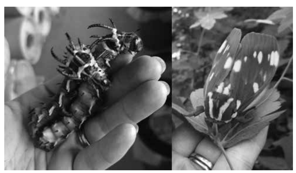
Lab-reared regal moth caterpillars and wild regal moth adult found in Virginia.

bodies and legs covered in red and orange fur, and their six-inch wings are patterned with red stripes and yellow spots. Unfortunately, while regal moths were historically part of New York's giant silk moth community, a confirmed siting for a wild regal moth caterpillar in New York has not been made since the 1950s. If you have seen either a regal moth caterpillar or an adult in New York state, please contact me (rmanderi@syr.edu).