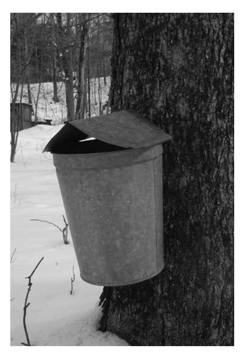
Figure 4. Metal buckets with lids that hang from the spile are the traditional method of collection. Historic spiles were 7/16" diameter, as pictured. Modern stainless steel spiles, such as from Next Generation Maple (www.nextgenmaple.com/spouts), insert into a 5/16" diameter hole.

In almost every area, or the next town over, there is a hardware store or maple supply company that can help with your sap collection needs. Meet the vendors and learn about what they have to offer. Vendors of maple equipment can provide the items you need, and instruction on how to use it. If you need to search for a vendor, use