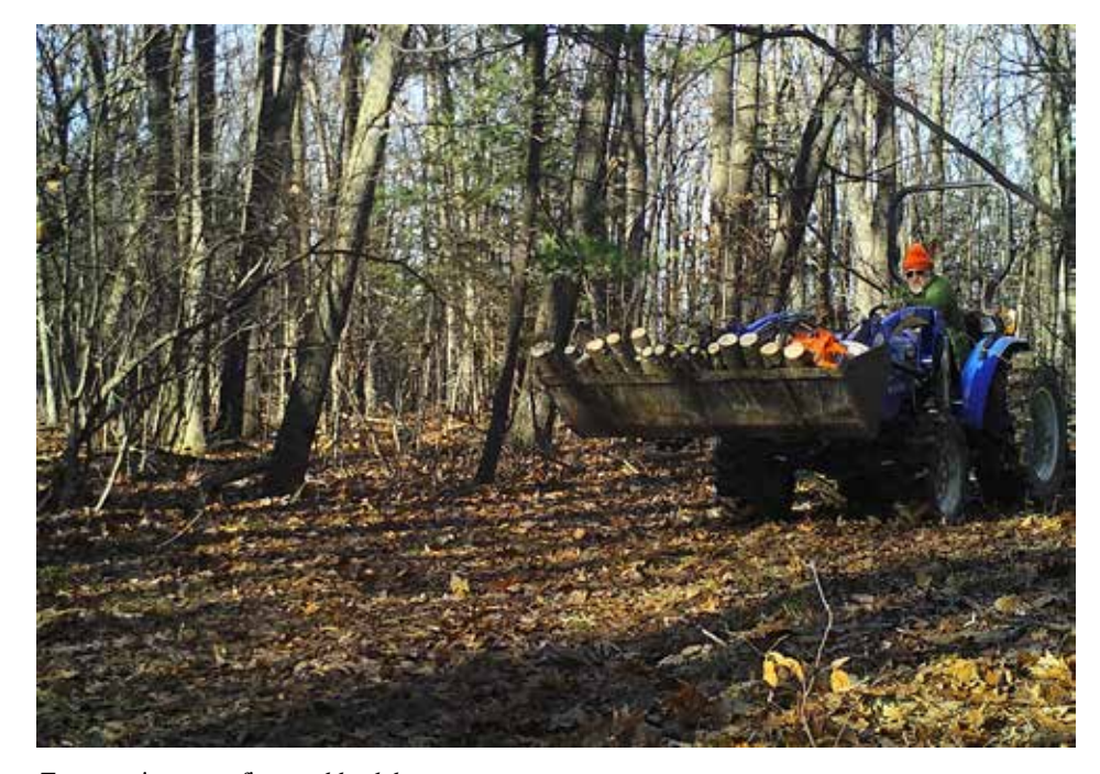
Transporting some firewood back home.

Tracy also owns 17 acres in Greene County, much of which is along a trout stream with a series of scenic waterfalls where his ancestors had water powered