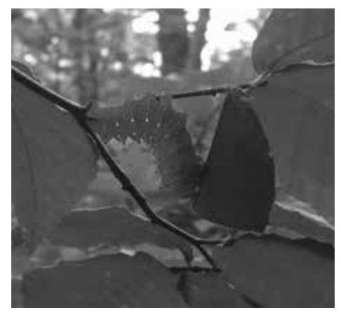
Wild Polyphemus Moth caterpillar feeding on beech.

While these beautiful insects are a delight to discover and marvel at, they also serve vital roles in our forests. As anyone that has experienced a gypsy moth or forest tent caterpillar outbreak can attest, these insects can eat a lot of leaves. And sure enough, these little herbivores eat more green plant material than any other plant-eater in the forests of New York. So why aren't the forests barren of leaves every summer from the sheer number of caterpillars in the forest? The answer is because the average caterpillar