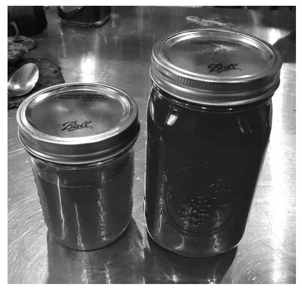
Figure 7. Mason and Ball jars make good syrup storage containers because the glass minimizes oxygen movement, and the jars can be easily inspected to ensure they are clean.

If you find yourself getting drawn into maple production, Cornell offers a