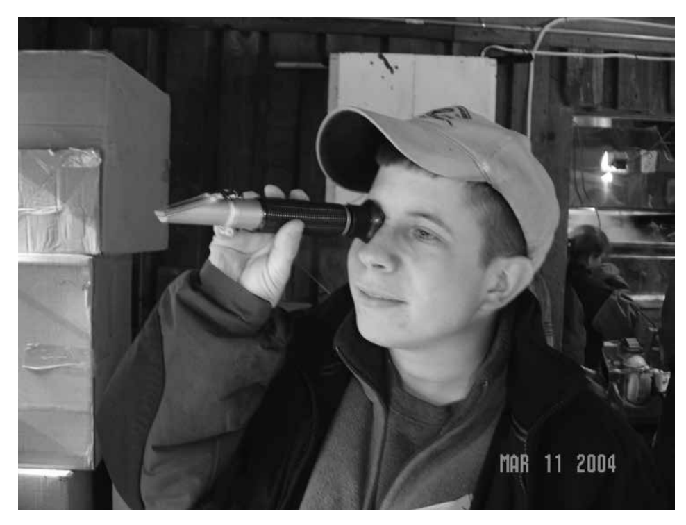
Figure 6. Refractometers are an accurate way to test the concentration of solids (sugars) in the sap to determine when it becomes syrup.

breadth of opportunities to learn about and expand your production. Visit the Cornell Maple Program website at www.CornellMaple.com. Also, we work closely with the NY State Maple Producers Association which also hosts educational events www.NYSmaple. com. A humorous parting resource is a youtube link from a community theater comedy skit describing one person's effort to make maple syrup. Don't let this scare you away, but do recognize that with maple production if something can go wrong, it may go wrong. You can view this at: https://youtu.be/EqreE O6mBU ≜