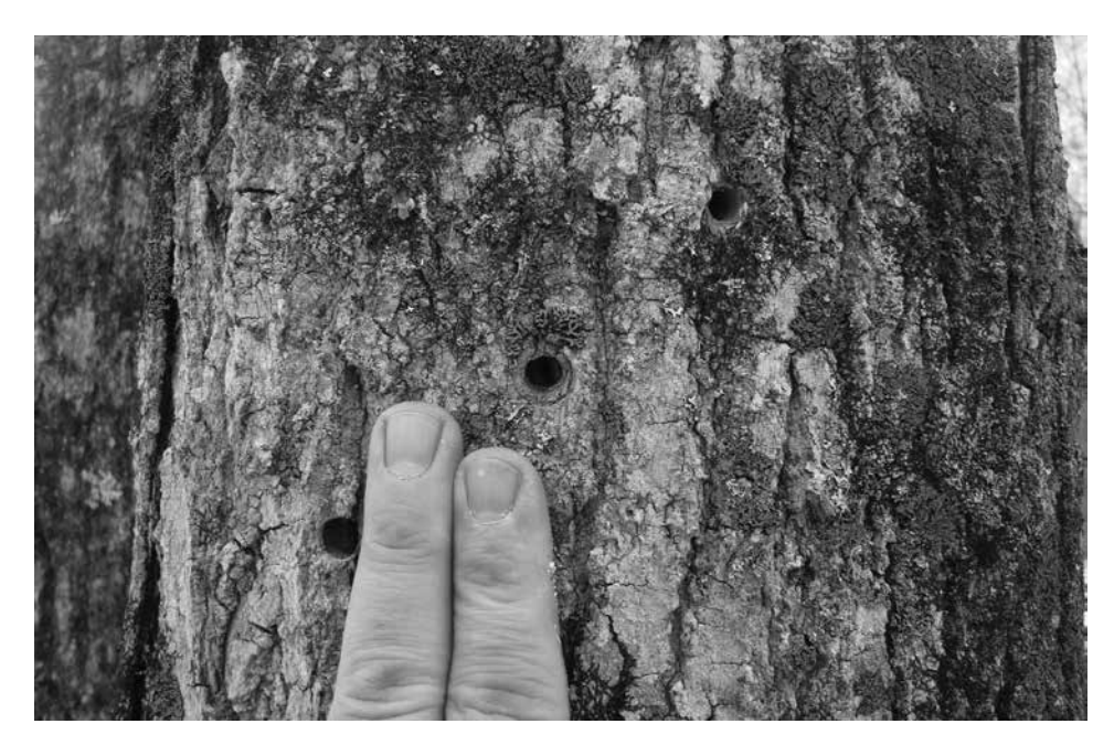
Figure 2. Tap holes need to be separated to allow access to wood that hasn't been stained following the previous tapping. At least "two fingers laterally and 2 to 4 inches vertically."

hole will be circular not elliptical. The hole should be about 2 inches laterally and 4 inches vertically away from last year's hole (Figure 2).