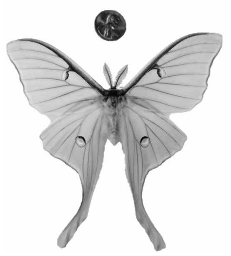
Preserved luna moth adult. Penny to scale.

large predator attempting to make a meal of them. These caterpillars are covered in spines, either green with a red stripe along the sides in the case of the Io moth or black speckled with white dots for buck moths. While spines are one way nature says "do not touch!", and the bright green of the Io moth caterpillar makes it easy to miss as they wander through the grass. Many an unfortunate soul wandering barefoot in their lawn has discovered just how painful those caterpillar spines can be!