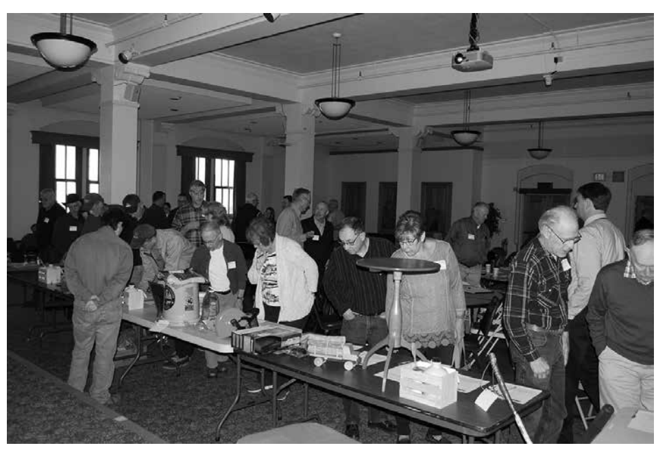
NYFOA members view some of the 2017 auction items.