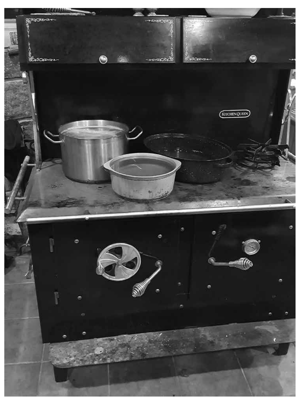
Figure 5. Indoor woodstoves or cook stoves are an economical way to boil sap into syrup. Electric stoves and outdoor propane boilers, such as turkey fryers, are the least economical method to boil sap.

the list of manufacturing companies on the Cornell Maple webpage, and search for their dealers http://blogs.cornell.edu/ cornellmaple/links/. Another vendor is Next Generation Maple whose webpage is www.nextgenmaple.com