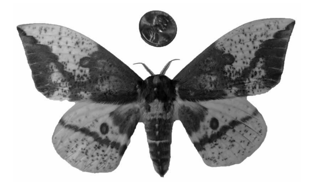
Preserved imperial moth adult. Penny to scale.

Where giant silk moth adults are spectacular winged wonders, their caterpillar stages may be equally as fantastic. Some species of caterpillars may reach up to six inches in length. Certain species in New York, like the io or buck moths, are well defended against any