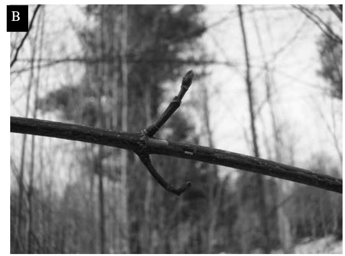
Figure 1. All maple trees have opposing buds. The buds produce leaves and twigs, which of course would also be opposing. Sugar maple (A) has sharp pointed buds. Red maple (B) has blunt or rounded buds. Other "opposite" species include the ashes, dogwoods, viburnums and horse chestnuts.