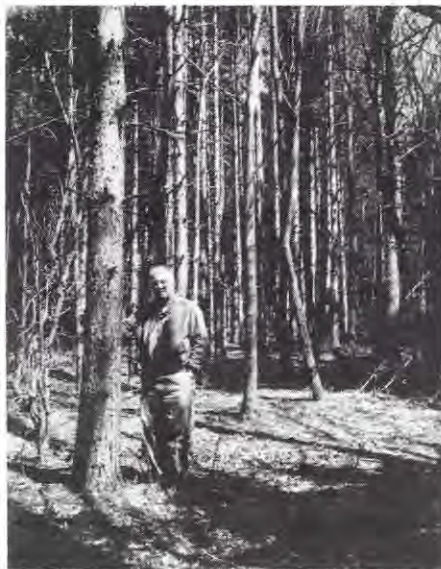
Small openings in pine plantations may be developed for red oak stands.

Possibly, you may find such sites within the conifer plantations where the stocking density is low or cleaning is necessary. Just make sure the site potential for red oak is good — you can clean out areas of over 1 acre, leaving an occasional pine for that necessary overhead shade. The same process may be used in your maple stands, breaking up "mono-types" for the eventual red oak stands.