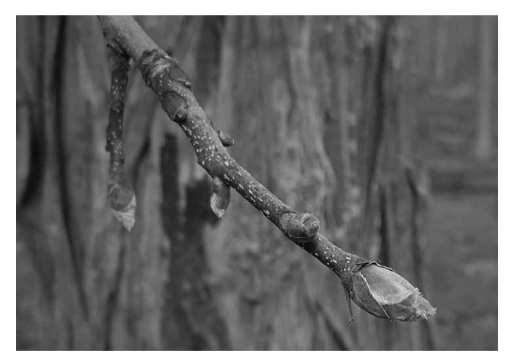
Figure 2. Hickory is an example of a genus that has alternate bud and leaf arrangement. Note also the overlapping or imbricate bud scales.

common way that foresters identify trees. However, young trees have bark that is usually quite different from the bark of that species on more mature trees. Thus, there is not one single feature that is always useful; the correct feature depends on the situation.