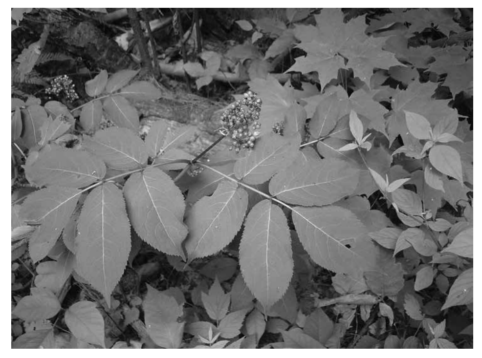
Figure 3. Compound leaves have multiple leaflets. On this elderberry, each leaf has 5 leaflets, note the leaves are opposite, and the elderberries are attached.

One of the most useful features to identify trees, at least to sort hardwoods into two broad categories, is whether the buds are paired on the stem, known as "opposite" arrangement, or if the buds are unpaired, known as "alternate," in their position along