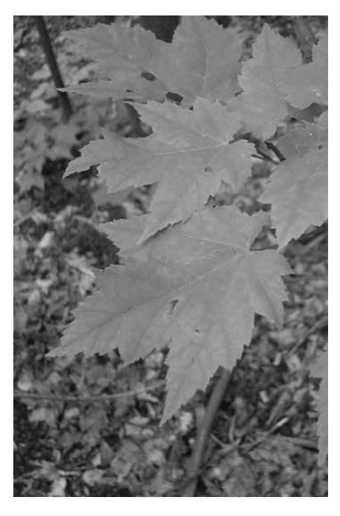
Figure 1. Red (left) and sugar (right) maple have similar looking leaves, although sugar has a smooth margin and red has a toothed margin.

There are advantages and disadvantages to using any one feature, but all are potentially useful. For example, twigs usually differentiate between species given differences in twig color, diameter, bud features, smell, and straightness. However, for about a month in the spring as the new twigs emerge, their typical characteristics are obscured. Similarly, the bark on mature trees is often fully diagnostic to separate among species, and this is the