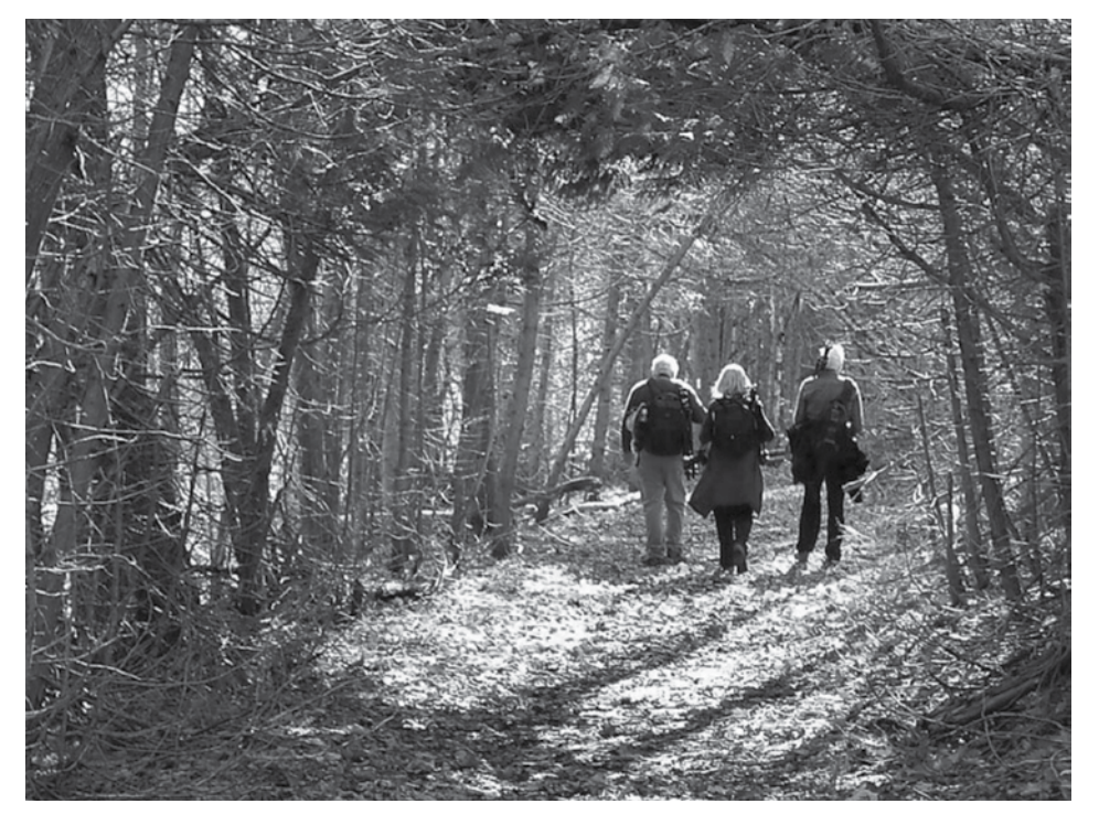
Take a Walk in the Forest Saturday May 16 and be part of a national program for informing friends and neighbors about good forest stewardship.

Now it is the day of the walk! Welcome people as they arrive and