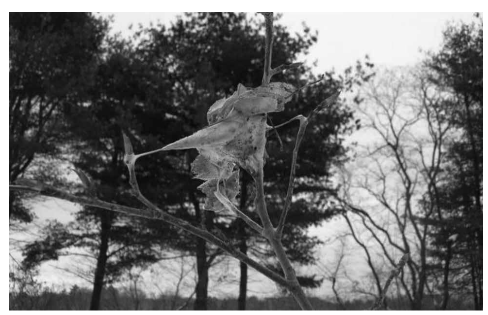
Browntail moth overwintering web. These are found at the top of trees and are easily seen in winter

Warm summers benefit BTM because they can speed development and they can enter winter as a larger 4th instar larva. This is significant because it is in the 4th instar that it begins to develop the urticating hairs and this early development prolongs our exposure. In mid-spring, as new leaves are emerging, the larvae will renew feeding and develop through 6<sup>th</sup> to 8<sup>th</sup> instar before wandering around looking for a place to pupate in late June to early July. These largish (1.5 to 2 inches) caterpillars can be distinguished from others like the forest tent caterpillar and gypsy moth by the red-orange tufts of hairs on the tail end. BTM will pupate either singly or