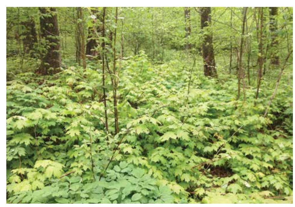
This natural regeneration of sugar maple has not been discovered by deer. Robert's been actively tubing some of these seedlings to ensure survival in case the deer do find this happy corner of the woods. The herbaceous understory plants indicate a fertile site, which will help the maple seedling gain height quickly.

line along the old field. Tapping these trees for the last five years or so resulted in maple syrup which he gives to friends and family.