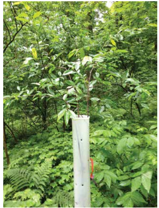
This black cherry seedling has emerged from its tree tube in good health. Protection from deer by tree tubes is Robert's preferred method.

From 1975 to 2000 he and his family used the land sparingly, mostly deer hunting, camping in the lean-to and collecting firewood. But then came the time when they began to plant a few hundred white spruce and other conifers. Around 2000, Robert planted an apple orchard in the lower field. Then in 2005-2006, the trees in the designated five acres were marked and girdled. A few years later the upper and difficult to access hillside was logged. This started Robert's planting of hardwood seedlings including black cherry, red oak, white oak, black walnut, and Sargeant's crab apple. During the three year period from 2013-2015, he planted 40 sugar maple seedlings in tree tubes, in addition to planting food plots and cutting brush in an effort to reclaim the lower field. He heavily pruned the ancient apple orchard in an effort to restore it, though this did not succeed.