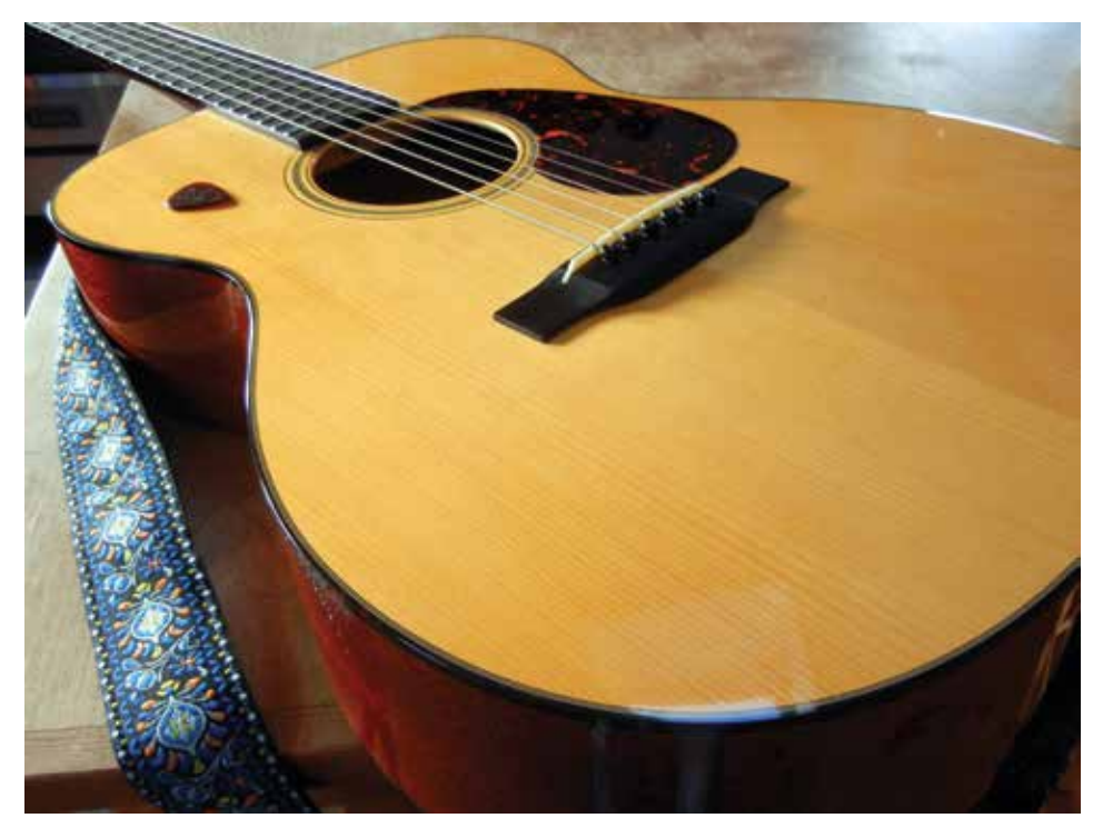
Acoustic flattop guitar with 'Adirondack' (red) spruce soundboard

To maximize their resonance and nuanced tone qualities, guitars have to be built lightly enough to vibrate freely, while remaining strong enough to endure the constant strain