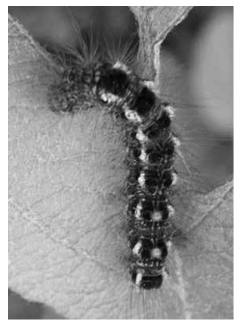
Browntailed moth caterpillar.