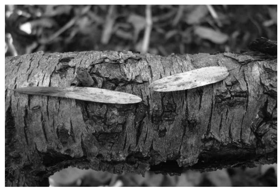
Figure 6. Green (left) and black (right) ash samaras are of different size and shape. The percentage of the wing that covers the seed helps distinguish green and white ash.

feature is to inspect the outer layer of the buds. Some buds have overlapping scales, called "imbricate." Other buds have scales that are valvate. Finally, some buds lack scales and are called "naked." Other diagnostic twig features include color, stoutness, straight vs. zig-zag, lenticels, and stipule scars.