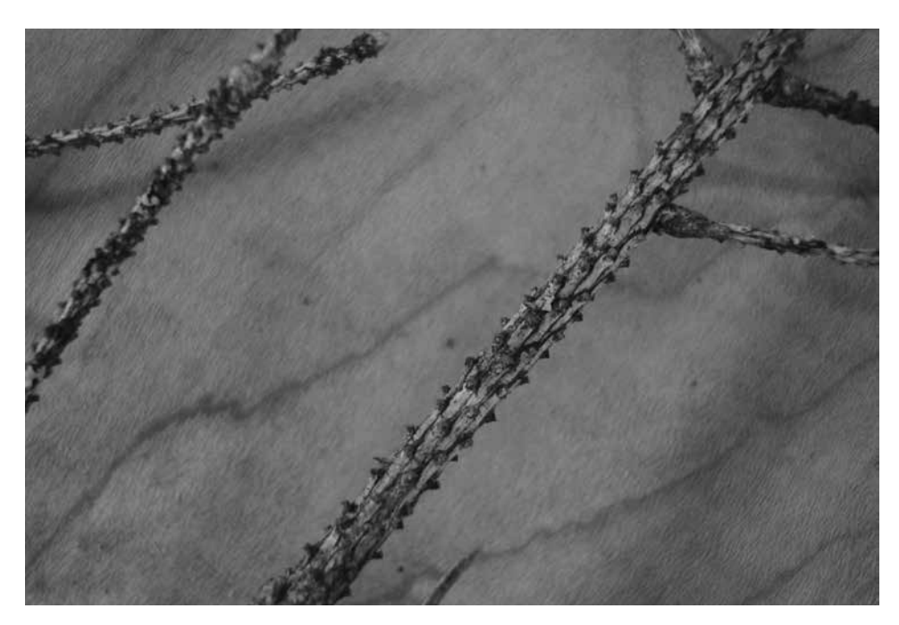
Figure 4. Only the spruce have peg-like projections called sterigmata that connect the single needle to the twig.

invariant within a species. The common margin types include smooth (known as "entire"), "serrate" or saw tooth like, and some variation of crenate or dentate (rounded or toothed). Entire margins are usually entire; there is not much variation. Serrate might be singly serrate, such as elm, or doubly serrate,