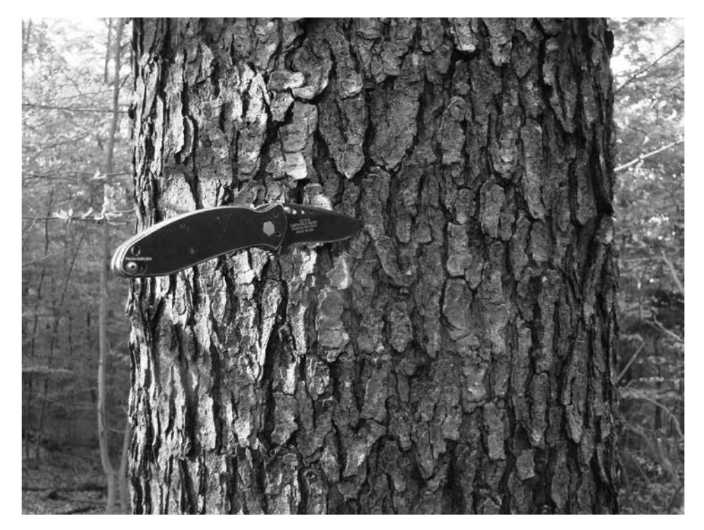
Figure 7. The bark of black cherry is described as "burnt potato chips" given the black plates.

Other features of twigs may include the presence of an aroma (e.g., yellow birch, cherry) or the construction of the pith. The pith is the spongy center of the twig and can have one of three types of construction: homogeneous, is solid and is most common; diaphragmed piths are solid with cross-longitudinal separations that