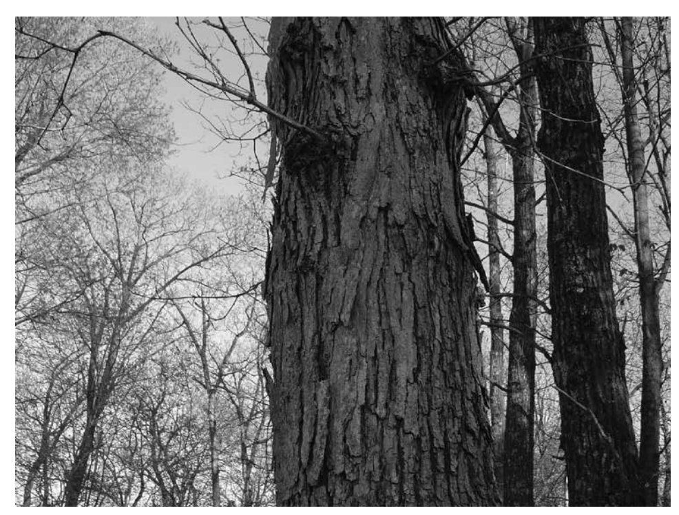
Figure 8. White oak bark is highly variable. This picture shows overlapping plates on the upper portion of the stem, and blocks or thick plates on the lower section.