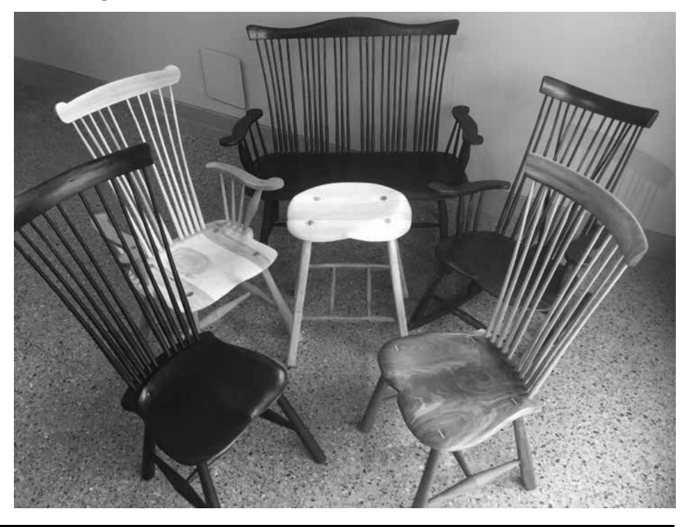
The New York Forest Owner 58:2 • March/April 2020

We look forward to seeing you this summer.