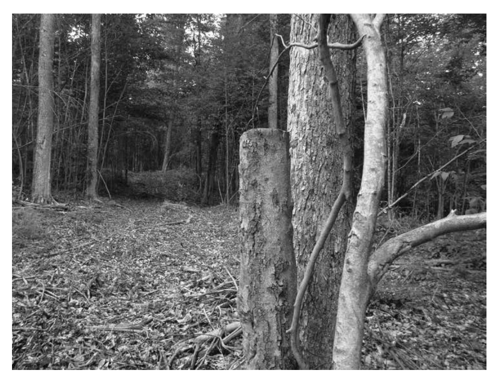
Figure 2: Bumper trees can be left along skid trails to protect valued trees that might otherwise be damaged by skidding. In this example, a beech tree was marked for harvest but the logger removed only the upper section to retain the high stump as a bumper that protected the maple. Logging during solid ground conditions (winter or late summer) reduces impact on root systems.

harvesting activity is directly connected to and supports one or more ownership objectives, and doesn't impair other high priority objectives. A successful harvest will move a priority objective closer to the desired future condition.