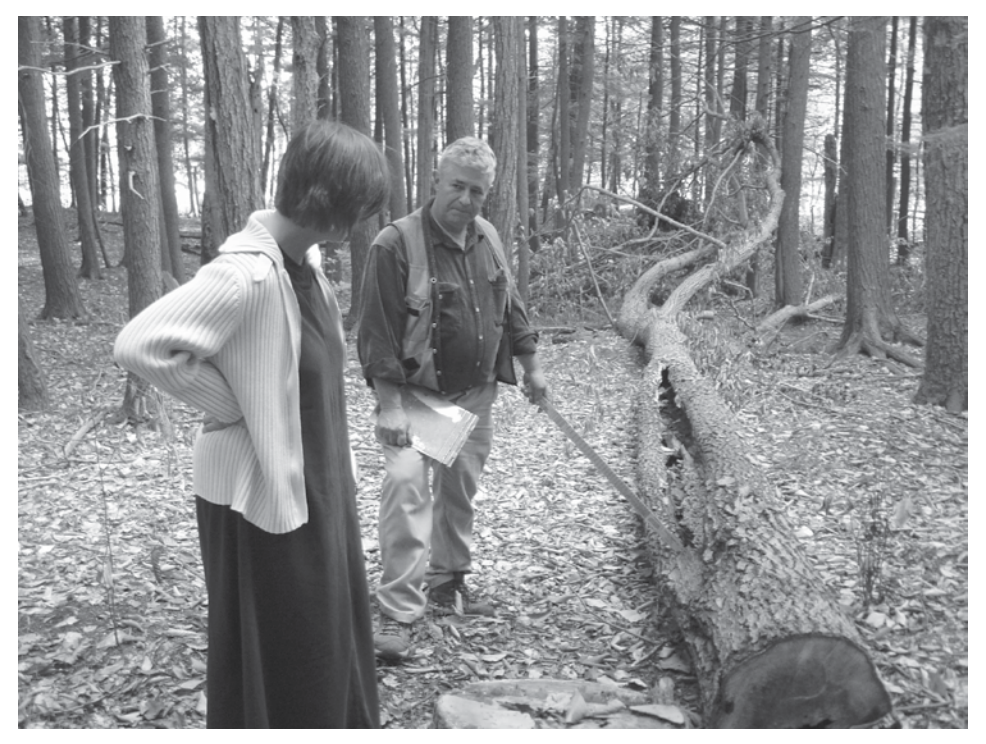
Figure 3: It is important to talk with your forester, as illustrated, and all people involved in the harvest. The chance for success is greatly increased if landowners, their forester and their logger talk about expectations and likely outcomes associated with the planned harvest. Communication during the harvest will help resolve misunderstandings or unexpected events.

sellers of woodlands should know the current condition and past treatment of a forest to be able to forecast the potential for revenue.