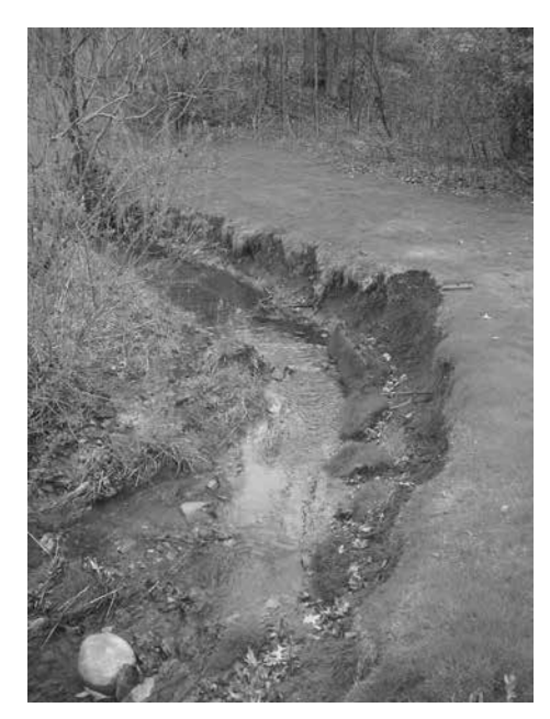
Example of soil erosion.

help regulate the rate and amount of surface water runoff that enters a stream, river, or lake. As water flows over the ground and through trees, they slow the water down. The water then can be absorbed into the ground where pollution in the water can be filtered by the soil and plant roots before it becomes ground water or a fresh water spring. Tree roots also help to hold soil in place so that when it rains it doesn't get washed into a local water body, making it dirty and destroying sensitive ecosystems.