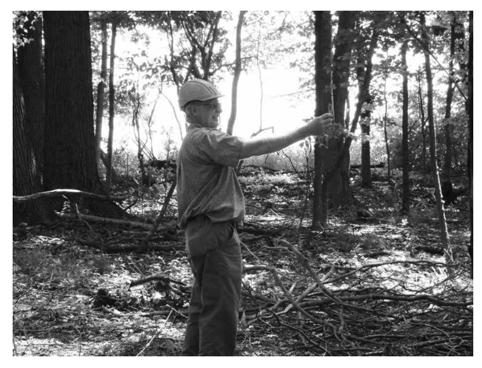
Figure 1: Foresters have training to inventory woodlots and describe the condition and abundance of trees. That information can be used to develop a silvicultural prescription and tree marking guide to aid in the selection of trees to cut and trees to retain.

Supporting owner's objectives – Ownership objectives should guide all decision-making in the woodlot. The harvest has potential for significant changes that will either advance or detract from the vision the owners have. If a written management plan doesn't exist or is not current, take the time to work with a forester to develop a plan before arranging the harvest. Communicate with family members or co-owners to make sure all objectives are articulated, evaluated and prioritized. Talk with your forester to make sure the