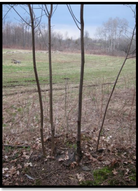
Figure 2. 2-Year-Old Stump