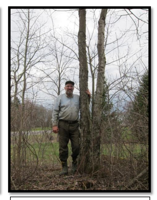
Figure 3. 9-Year-Old Stump Sprouts