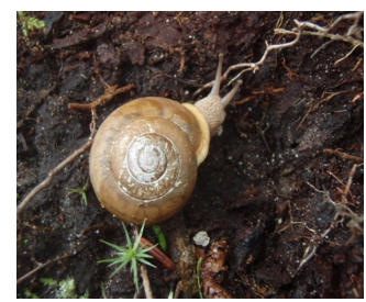
Great year for snails...

What started out as a wet, drizzly morning had changed into a warm and pleasant day.