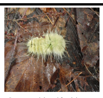
Can you identify this fuzzy critter?? See bottom of page for answer

Check out NYSDEC Division of Lands and Forests new e-newsletter at: <a href="http://www.dec.ny.gov/lands/74205.html">http://www.dec.ny.gov/lands/74205.html</a>