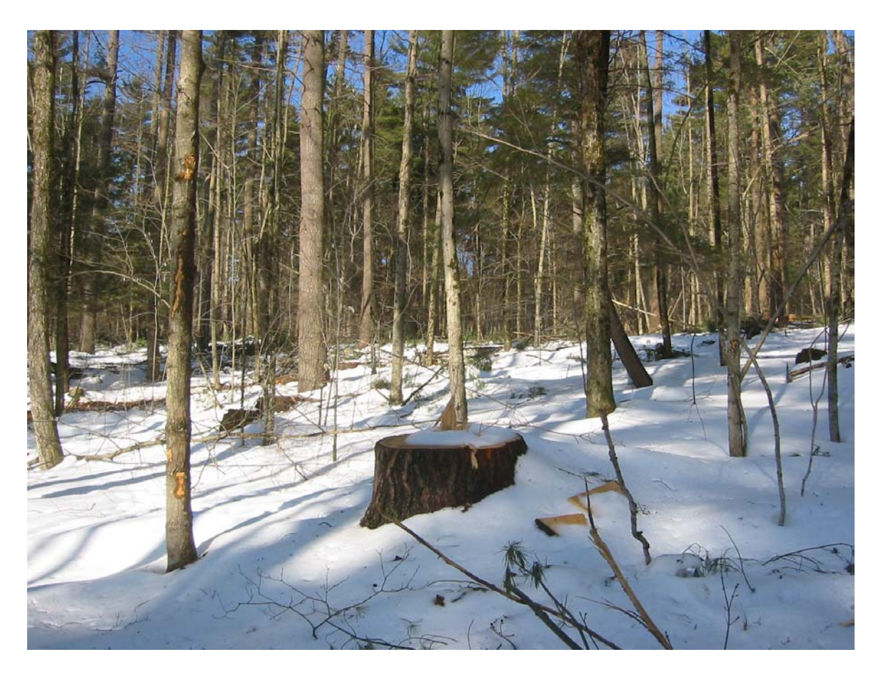
Residual stand following a harvest this past winter on the Bill Knox property in Saratoga County