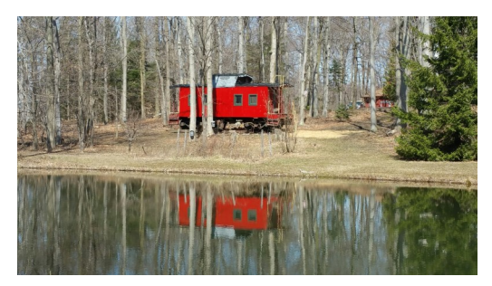
Doesn't everyone have a caboose in their forest?