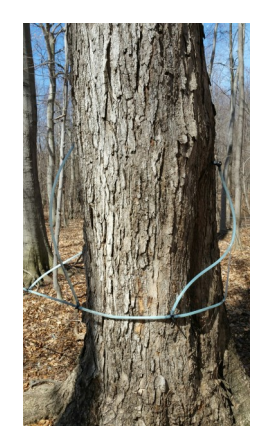
3 tap maple.