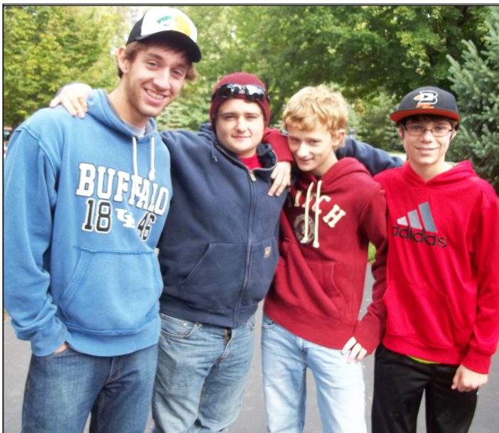
Four future NYFOA leaders helped out at Bob Glidden's woodswalk in September. Apologies for not learning their names.